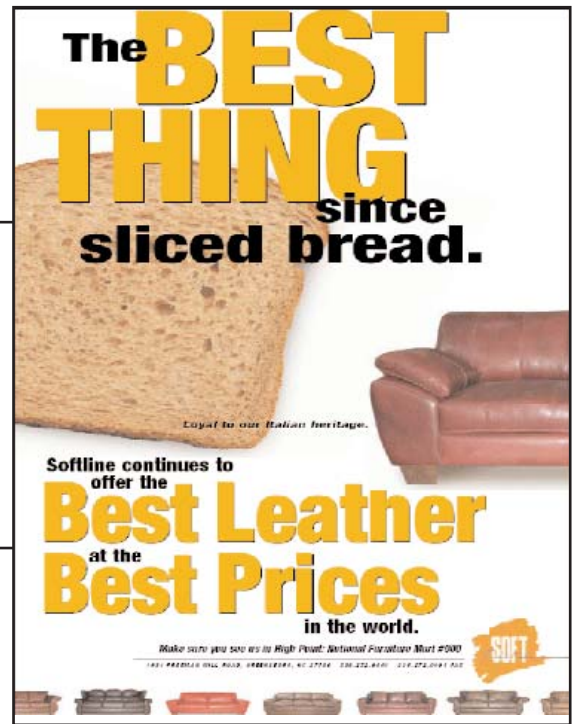
Sample of eBlast

An eBlast is our digital version of direct mail. This targeted program allows you complete flexibility in messaging and timing. Show your story through compelling graphics, along with your own call-to-action aimed directly at retailers and manufacturers.